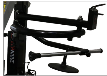
T2205 PLUS assist arms.