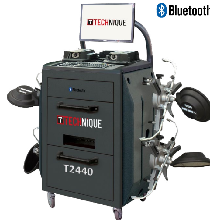
Control center complete with printer, keyboard, and mouse.