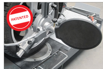
Patented 3D target (Solid Vision Technology.)