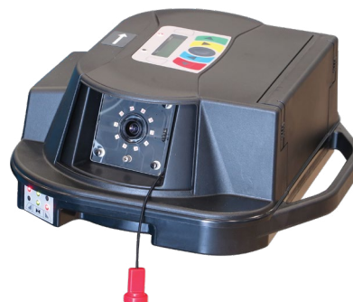
High resolution megapixel camera.