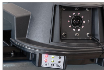
LED repeater for guided measurements without monitor.