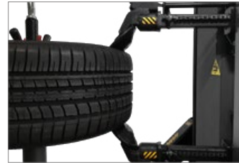
Double roller bead breakers.