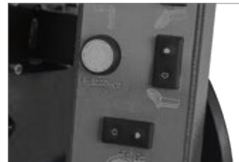
Memory system with automatic head repositioning.