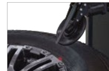
Laser pointer that indicates proper head positioning.