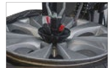
Quick clamping lock for rims.