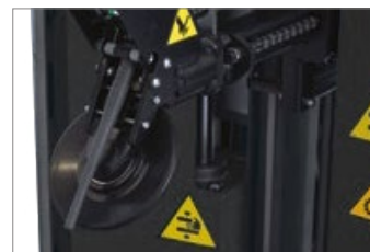
Sensor with automatic indent function.