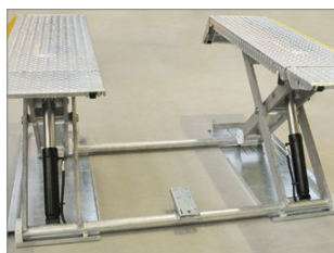
Fire galvanised surface treatment.

* Full parts and labour warranty excludes electronics, includes motor.