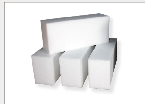
Included: Set of 4 polymer pads (50 x 150 x 340 mm).