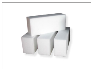
Polymer pads 100 x 150 x 340mm.