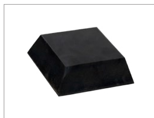
Rubber truncated pyramid pad.