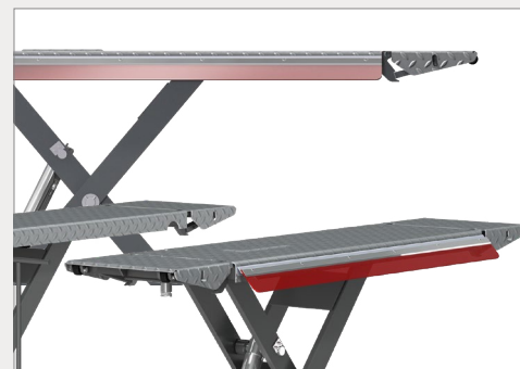
Flaps to increase the length of the ramps, easy to lock and unlock.