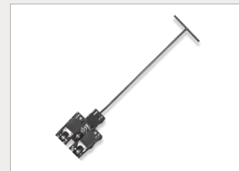
Mobile set to move your lift easily and quickly.