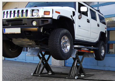
For off-road and SUV vehicles.